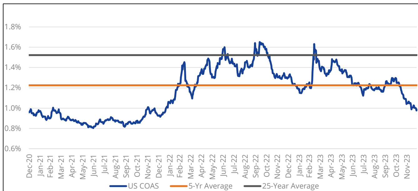
Chart 3: US Corporate Bond Spreads

The chart below shows the premium an investment grade corporate borrowing in the US would have to pay over the equivalent US government Treasury with a similar maturity profile. Because of this I would prefer Government Bond and Investment Grade Credit over higher yielding bonds at the current time.